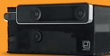
SafeTrack™ camera box